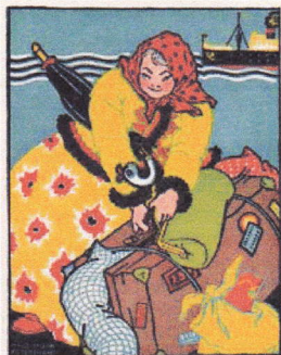
One of Maud and Miska Petersham's illustrations for the children's book "The Poppy Seed Cakes."